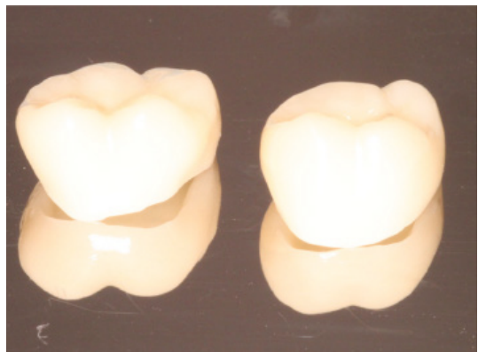
Crowns were fabricated from Zirconia substrate using a digital scan