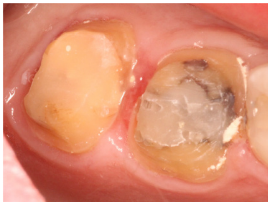
Immediate temporary removal - notice excellent gingival health